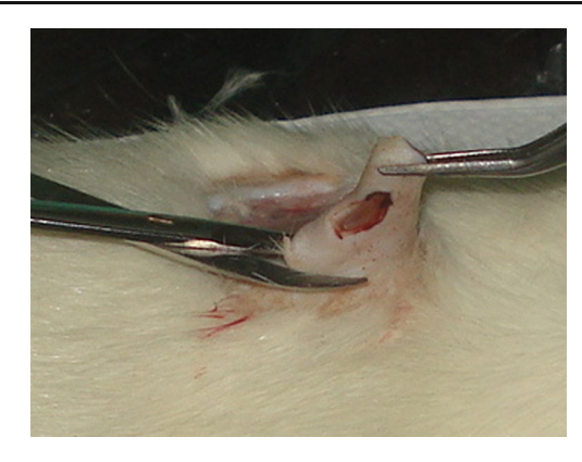
Fig. 2 Tissue fragment representative of the cutaneous ulcer

10 mM EDTA and 20 KI aprotinin A/100 ml). The samples were centrifuged for 10 min at 3,000×g, and the supernatant was frozen at -70 °C until quantification was performed. IL-1 \beta , IL-6, IL-10 and TNF- \alpha levels were estimated using a commercially available ELISA kit (R&D Systems, Minneapolis, MN, USA) according to the manufacturer's guidelines. Briefly, 96-well plates were coated with the capture antibody (1:200) overnight and incubated with blocking buffer at room temperature for 1 h. Samples were added in duplicate and incubated overnight at 4 °C. Biotinylated antibodies (1:200) were added, and the plates were incubated for 2 h at room temperature. A 30-min incubation with streptavidin-HRP (1:200) was followed by detection using 3,5,3′,5′-tetramethylbenzidine and H_2O_2 . The plates were read using a 450-nm wavelength laser.