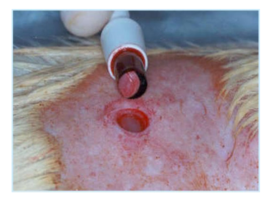
Fig. 1 Cutaneous circular wound located in the dorsal region of a rat

Total protein was extracted, and inflammatory cytokines were measured using 100 mg of tissue/ml in PBS buffer supplemented with 0.4 M NaCl, 0.05 % Tween 20 and protease inhibitors (0.1 mM PMSF, 0.1 mM benzethonium chloride,